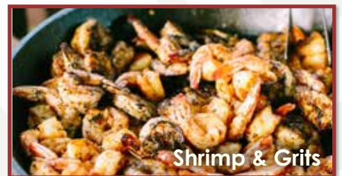
Shrimp & Grits