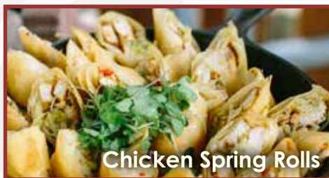
Chicken Spring Rolls